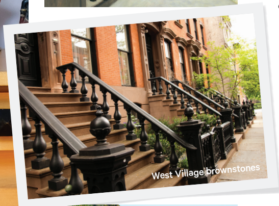
West Village brownstones